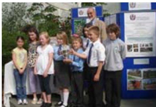
Children from Glasgow primary schools are awarded the Miller Cup

Scottish Allotments have three trophies the Stevenson Amenity shield, Robert Greig memorial Trophy and the Miller Cup. Each year these are offered in different regions across Scotland to encourage good practice in allotment sites, recognise individual excellence and encourage young gardeners.