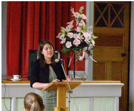
Aileen Campbell MSP addresses the conference June 2008